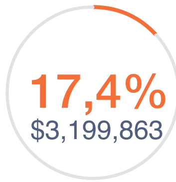
Mental Health Fund