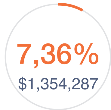
Health infra- structure Fund