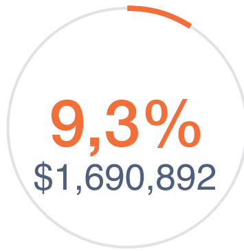
Mental Health Fund