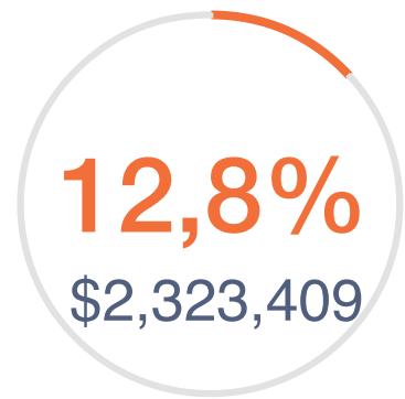
Health infrastructure Fund